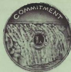
Clutch-back Award for sponsoring one or more new members.

Commit yourself and participate in your District Governor's January-February-March Membership Development Program.