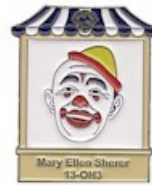
All American Smiling Clown (March 2021-CC)