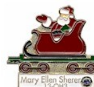
The Santa Railroad Express (February 2018-AT)