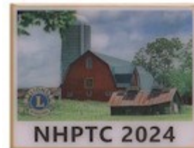
New Hampshire Pin Traders Present the Barns and Silos of The Granite State March 2024-FG