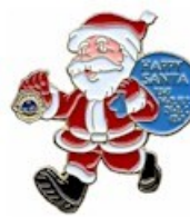
Happy Santa Claus in Winchester (October 2015-HS)