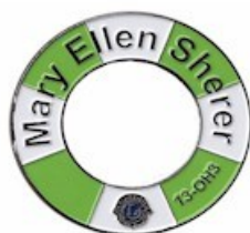
The Life Preservers (November 2019-WW)