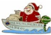
Santa in His Motorboat "Light Blue" (February 2016-HS)