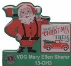
Santa and his Farm Raised Christmas Trees (March 2023-FG)