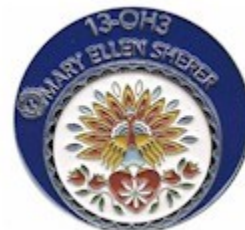
World Famous Pennsylvania Dutch Hex Barn Signs (August 2022-CC)