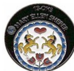
2023 Hex Signs Decorate Pennsylvania Dutch Farm Barns (March 2023 FG)