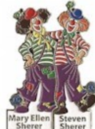
The two pin puzzle set. (February 2022-CC)