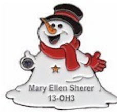
The Snow People in Iowa. Snowman #3 (June 2020-WW)