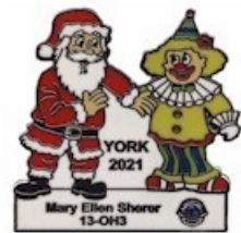
Santa Greet the Clown All Stars (April 2021-CC)