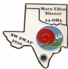
The Whimsical Water Creatures of the Great Southwest