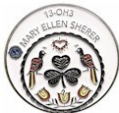
World Famous Pennsylvania Dutch Hex Barn Signs II (November 2022-FG)