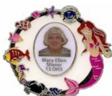
The Pin Trading Mermaids (Nov/Dec 2018-WW)