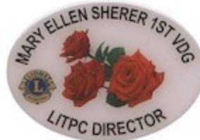
Blue Ribbon Winners from the Rose Garden November 2023-F&G