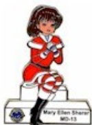
The Girls of Mr. & Mrs. Santa Claus (January 2016-HS)