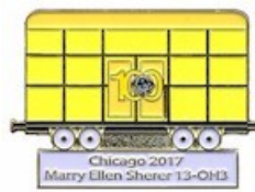
The Lions Centennial Chicago Express (June 2017-AT)