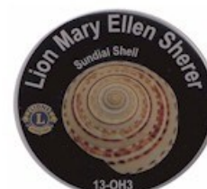
The Shell Collection (March 2019-WW)