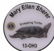
Invasion of the Turtles (March 2019-WW)