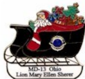
Santa and His Sleigh Number 4 (February 2015-HS)