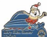
Santa on His Water Jet Ski (March 2019-WW)