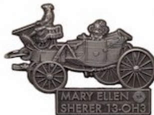
The Good Old Horse and Buggy Days Featuring the Clowns of the Circus (June 2022-CC)