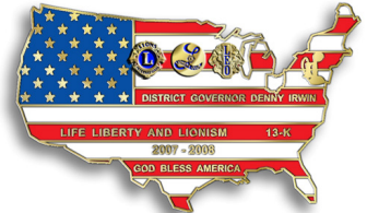
Gov. Irwin's' Personal Pin