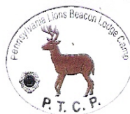
Actual size of Pins

All proceeds will go to Campaign Sight First II