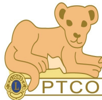
Winter Retreat January 2017