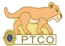
MD 13 Convention May 2017