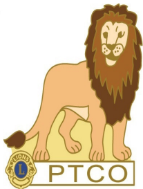
Winter Retreat January 2016 {Already Issued}