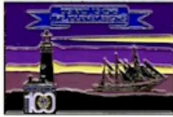
District 13-OH5 District Pin

Additional district and club pins have been issued since July 1st.. Pictures for those pins were not available at this time.