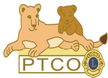
MD 13 Convention May 2016 (Already Issued)