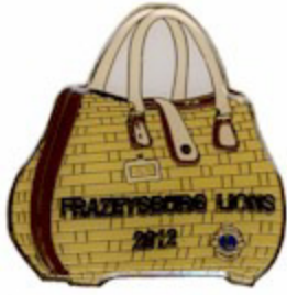
Frazeysburg Lions Club