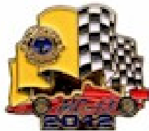
MD 13 2012 Convention Pin