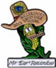
Millersport Lions Club