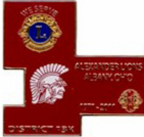
Alexander Lions Club