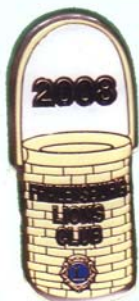
Frazeysburg 2008 Basket