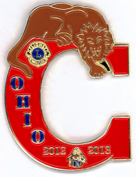
District 13-C District Pin