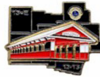
District 13-E Governor and District Pin