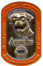
District 13-G Governor and District Pin