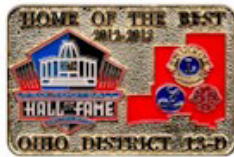
District 13-D Governor and District Pin