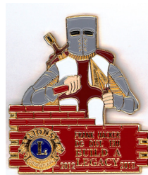
District 13-H Governor Pin