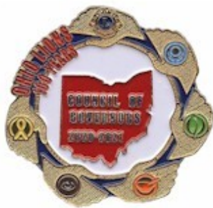
2021 MD 13 State Council Pin