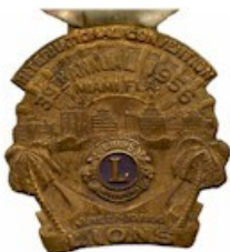
June 27-30, 1956 39th AC Miami, FL.