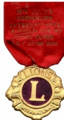
*July 23-25, 1935 19th AC Mexico City, Mexico.