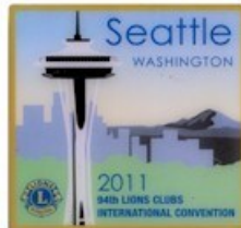
July 4-8, 2011 94th AC Seattle, WA.