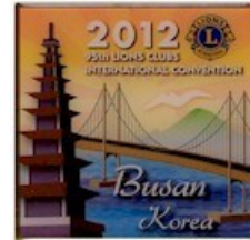
June 22-26, 2012 95th AC Busan, Korea.