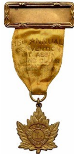
*July 14-17, 1931 15th AC Toronto, Ontario, Canada.