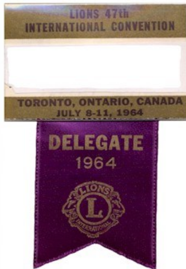
July 8-11, 1964 47th AC Toronto, Ontario, Canada..