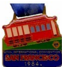
July 4-7, 1984 67th AC San Francisco, CA.