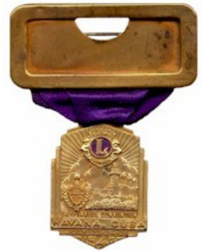
*July 23-25, 1940 24th AC Havana, Cuba.