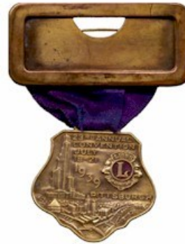
July 18-20, 1939 23rd AC Pittsburg, PA.