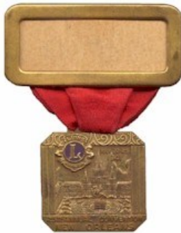
*July 22-25, 1941 25th AC New Orleans, LA.