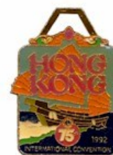
June 22-26, 1992 75th AC Hong Kong.