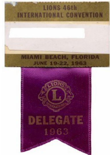
June 19-22, 1963 46th AC Miami, FL.