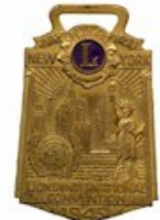
July 18-21, 1949 32nd AC New York, NY.