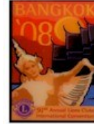
June 23-27, 2008 91st AC Bangkok, Thailand.