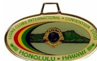
June 19-23, 2000 83rd AC Honolulu, HI.