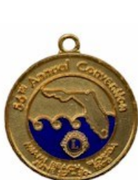
June 27-30, 1973 56th AC Miami, FL.