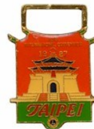
July 1-4, 1987 70th AC Taipei, Taiwan, ROC.