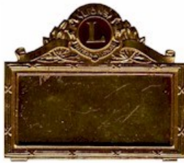
*June 24-26, 1924 8th AC Omaha, NE.

Note: Annual Convention will be abbreviated to AC to provide space.