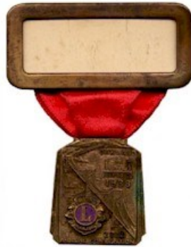
*July 19-22, 1938 22nd AC Oakland, CA.