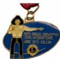
June 25-28, 1975 58th AC Dallas, TX.