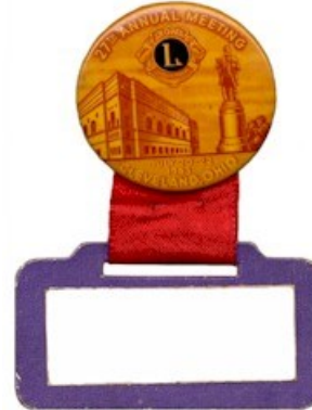
*July 20-22, 1943 27th AC Cleveland, OH.