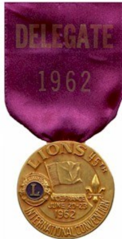
June 20-23, 1962 45th AC Nice, France.