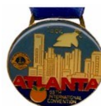
June 30-July 3, 1982 65th AC Atlanta, GA.