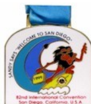
June 28-July 2, 1999 82nd AC San Diego, CA.