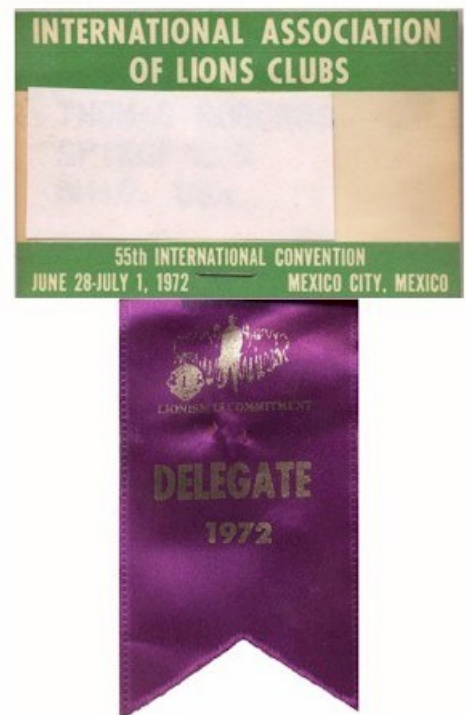
June 28- July 1, 1972 55th AC Mexico City, Mexico.