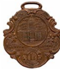
July 15-18, 1930 14th AC Denver, CO .