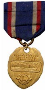
#June 15-18, 1927 11th AC Miami, FL.