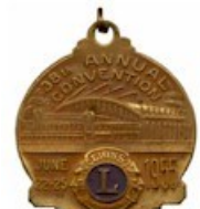
June 22-25, 1955 38th AC Atlantic City, NJ.