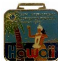
June 23-26, 1976 59th AC Honolulu, HI.