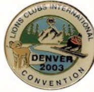
#June 30-July 4, 2003 86th AC Denver, CO.