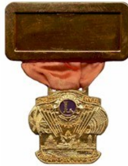
*July 21-24, 1942 26th AC Toronto, Ontario, Canada.