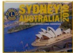
June 28-July 2, 2010 93rd AC Sydney, Australia.