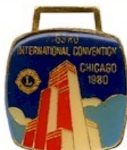
July 2-5, 1980 63rd AC Chicago, IL.