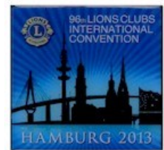
July 5-9, 2013 96th AC Hamburg, Germany.