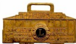
June 26-29, 1957 40th AC San Francisco, CA.