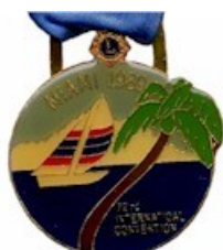
June 21-24, 1989 72nd AC Miami, FL.