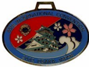
July 8-12, 2002 85th AC Osaka, Japan.