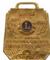
July 9-12, 1958 41st AC Chicago, IL.