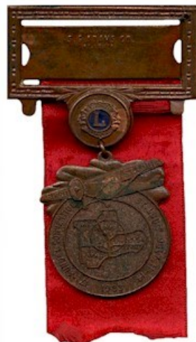
*July 11-14, 1933 17th AC St. Louis, MO.