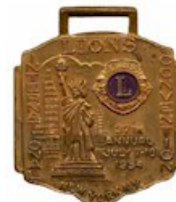
July 7-10, 1954 37th AC New York, NY.