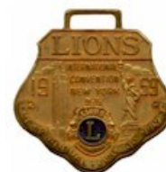
June 30-July 3, 1959 42nd AC New York, NY.