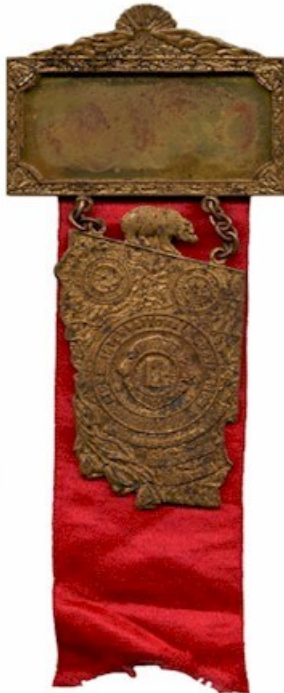
*July 21-24, 1926 10th AC San Francisco, CA.