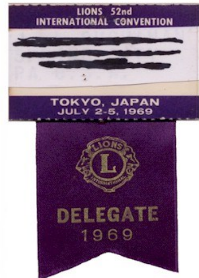
July 2-5, 1969 52nd AC Tokyo, Japan.