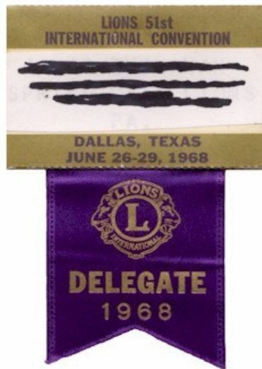
June 26-29, 1968 51st AC Dallas, TX.