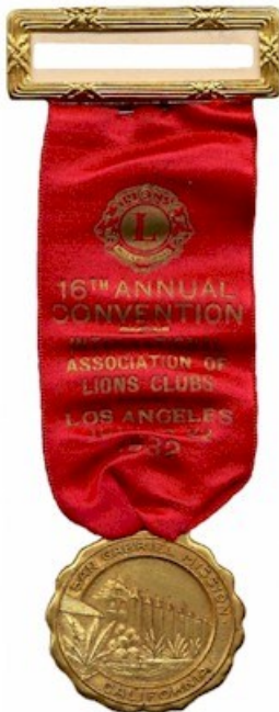
*July 19-22, 1932 16th AC Los Angeles, CA.