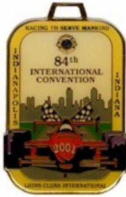
July 2-6, 2001 84th AC Indianapolis, IN.