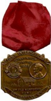
*June 18-21, 1929 13th AC Louisville, KY.