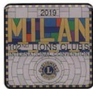
July 5-9, 2019 102nd AC Milan, Italy.