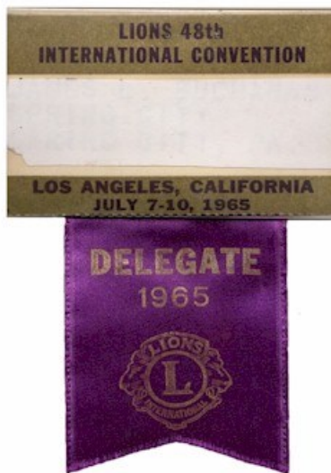
July 7-10, 1965 48th AC Los Angeles, CA.