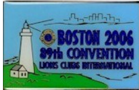
*June 30-July 4, 2006 89th AC Boston, MA.