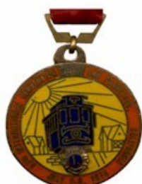
July 3-6, 1974 57th AC San Francisco, CA.