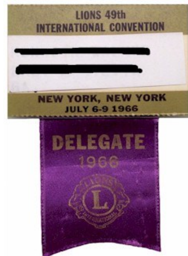
July 6-9, 1966 49th AC New York, NY.