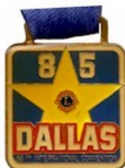
June 19-22, 1985 68th AC Dallas, TX.