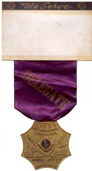
July 6-9, 1960 43rd AC Chicago, IL.