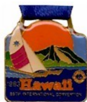
June 22-25, 1983 66th AC Honolulu, HI.