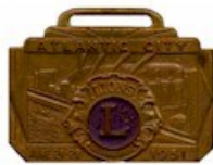
June 24-28, 1951 34th AC Atlantic City, NJ.