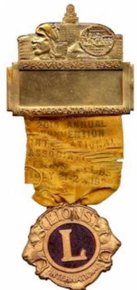
*July 21-24, 1936 20th AC Providence, RI.