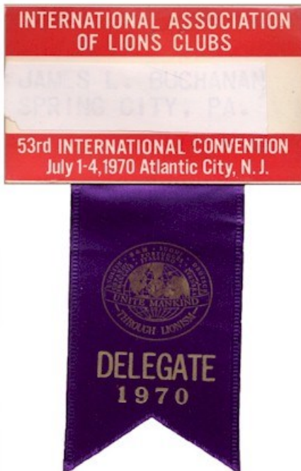
July 1-4, 1970 53rd AC Atlantic City, NJ.