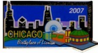
July 2-6, 2007 90th AC Chicago, IL.