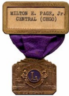
July 20-23, 1937 21st AC Chicago, IL.