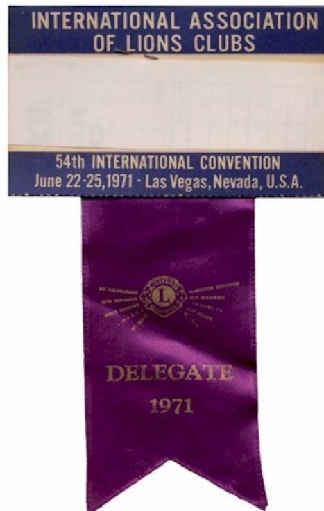
June 22-25, 1971 54th AC Las Vegas, NV.