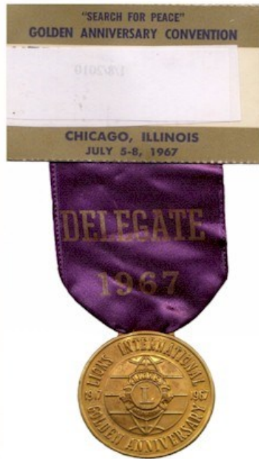
July 5-8, 1967 50th AC Chicago, IL.