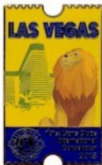
June 28 - July 3, 2018 101st AC Las Vegas, NV.