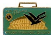
June 29-July 2, 1977 60th AC New Orleans, LA.