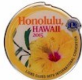
June 26-30, 2015 98th AC Honolulu, HI.