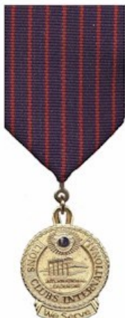
+IP Joe Preston Leadership Medal