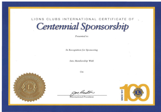
*2015 Joe Preston